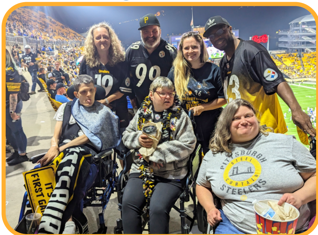
A few residents and staff members recently took in a Steeler game at Acrisure Stadium! Look at that black and gold!